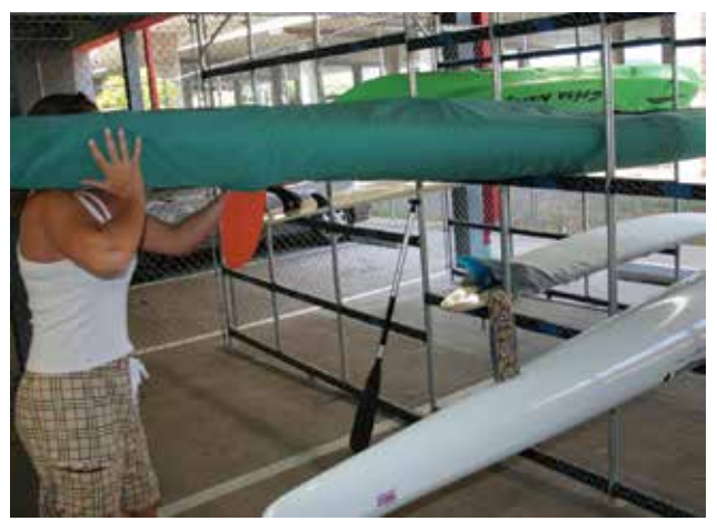
Hawaii Self Storage said many of its customers store their surf boards and kayaks horizontally to protect from damage.

"It's open air in our covered garage, so [client] equipment is protected from the sun and always stays dry," he explained.